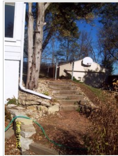
Garage side yard with gate entry.