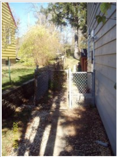
Side yard with gate