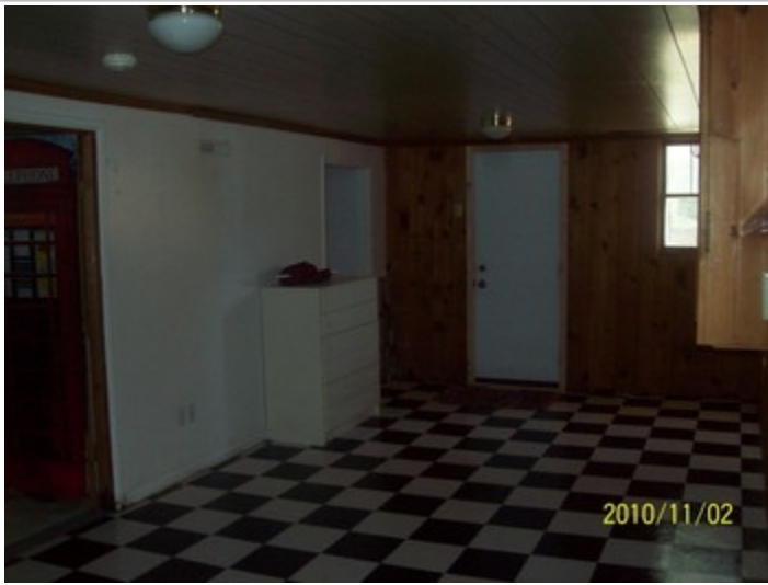
Basement storage and bath