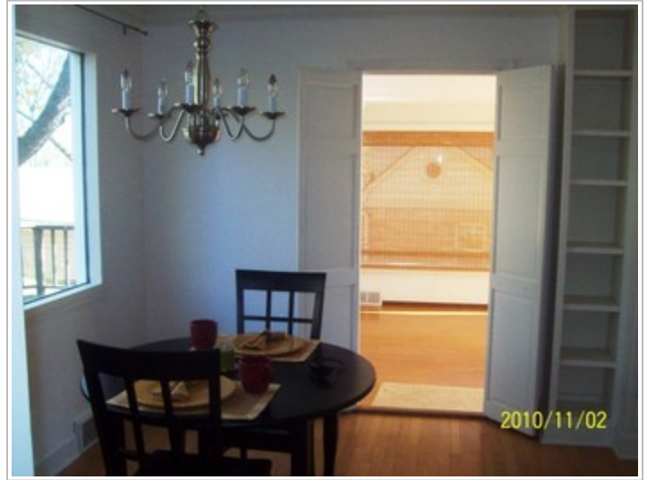
Dining room opens to sunroom