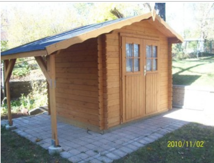
Tool shed or playhouse